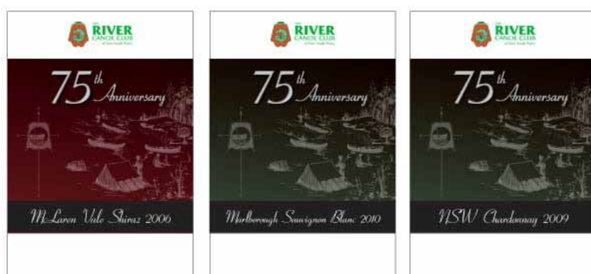
Actual wine labels above

These wines are available for members and their friends until the end of the year at a cost well below bottle shop prices. The (small) profit made will go towards fixing boats, the purchase of additional equipment and Clubhouse repairs.