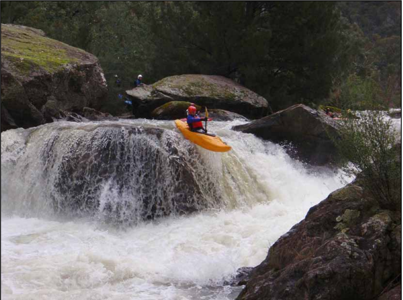
Yoda levitates on the last drop (from below).

Everything is paddleable at this level, and a lot of fun. The last drop, 100m before the takeout, is a great example. To scout or portage this rapid requires a trip through the biggest blackberry bush in Australia, so we all ran it blind (it is a well known rapid and had been done the week before so we knew it was clean). A 3m drop into a mass of rushing water is a little intimidating but it is probably one of the easiest rapids on the river!