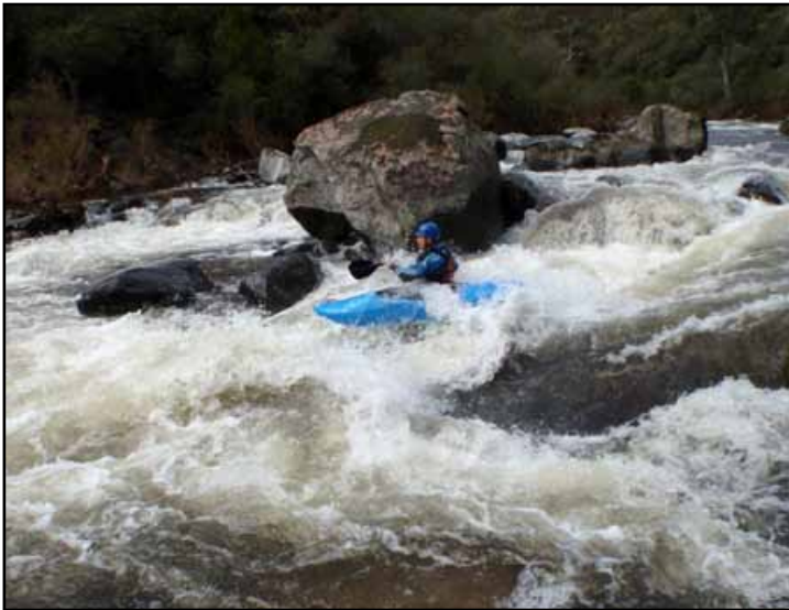
More fun in the Gorge section.