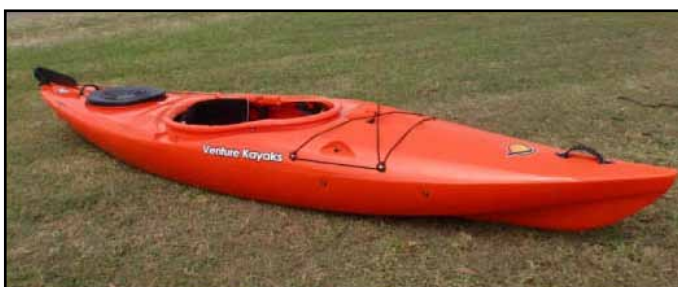
Venture Kayaks Flex II - The Flex has been designed to be flexible whether the water is calm or moving, this boat is in it's element.

Contact Gaye Foster on 0432.266.964 or gayefoster@optusnet.com.au