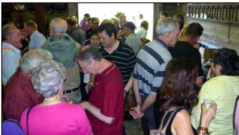
Looking through the Club house at memorabilia.

I would like to end by thanking Marackville Council and congratulating all club members for making this 75th Anniversary possible.