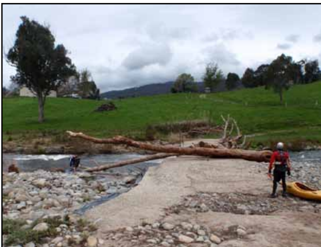
A better view of the tree that got washed into the bridge.