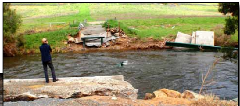
Georgie checking a washed away bridge that wasn't that old. Luckily this road didn't have to be crossed.