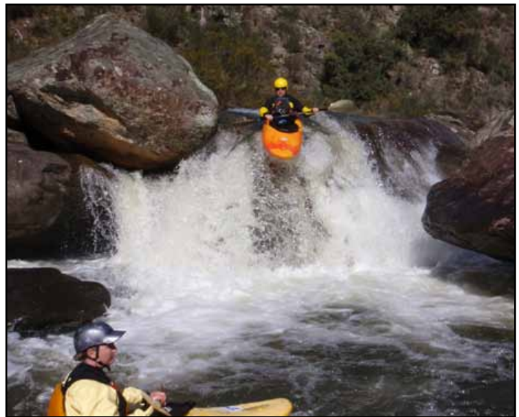
Ian giving his new boat a run.

It is a great little river, dropping consistently along the length of this section. It requires good boat scouting skills and the ability to eddie hop through rapids, because there are a few dangers around in the form of branches, undercut rocks and a few steep drops.